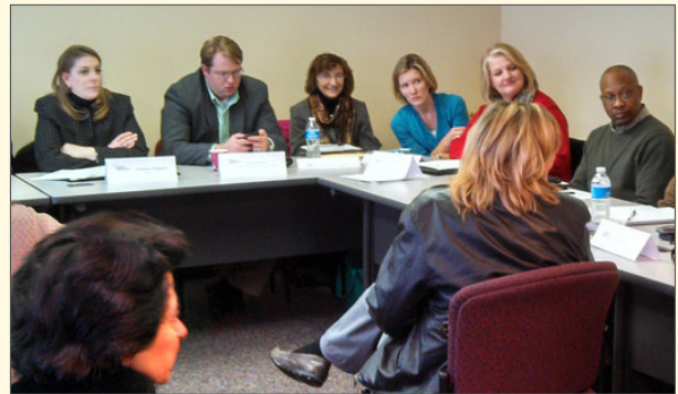
Regular BRN roundtable meetings contribute to staff development and peer-to-peer learning.

The BRN Expansion project develops proactive, business outreach strategies. The new BRN teams created with the WIF grant have developed partnerships with the other early agency partners in their regions including chambers of commerce, economic development organizations, state and local government organizations, and colleges and universities. Now, the five local BRN teams jointly hold regular roundtable meetings that contribute to staff development and peer-to-peer learning.