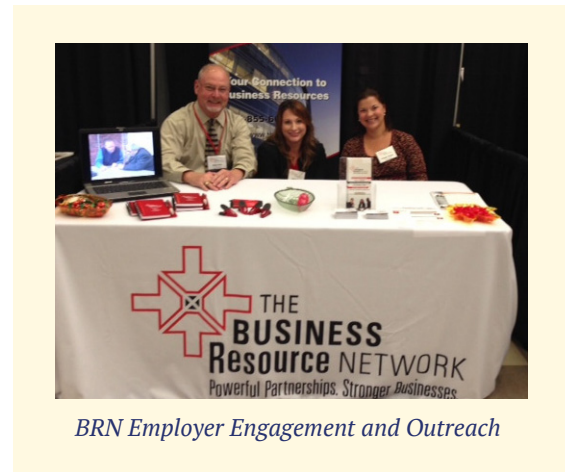
BRN Employer Engagement and Outreach