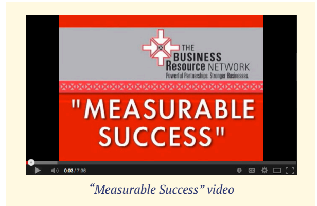
“Measurable Success” video